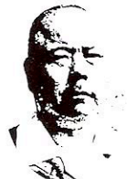
The World War II Japanese forces, headed by Gen. Yamashita, officially surrendered on September 3, 1945 at the US High Commissioner's residence at Camp John Hay.