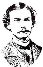
Camp John Hay was named after John Milton Hay, the Secretary of State during the administration of President McKinley and Roosevelt.

To walk off a meal with a bit of exploration, visit the art park, used for poetry readings, sculptures and art exhibits, or the eco-trail, whose path takes you up hills, past lakes, across bridges, and passes by a dap-ay, a traditional meeting place for town elders. And if one morning you awake having dreamt of the Camp's colorful past, a visit to the Historical Core is a must. The Bell Amphitheatre, Bell House and the 500-meter historical trail symbolize the historical significance of CJH.